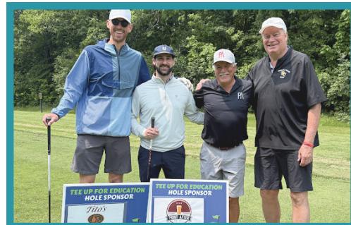
The Franklin Educational Foundation annual Tee-Up for Education outing raised close to $38,000 for grants, scholarships & projects!