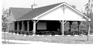
Vernon E. Barg Pavilion

2022 Park Permit applications for Franklin groups or residents for reserving Lions Legend Park (Lions or Vernon E. Barg Pavilions), Market Square, Ken Windl Pavilion, Franklin Woods Pavilion, or Pleasant View Pavilion, will be accepted at City Hall, 9229 W. Loomis Road, beginning Monday, January 3, 2022. Applications must be made in person and permits will be issued on a first-come, first-serve basis. The front entrance of City Hall will open at 7:30 a.m. at which time numbers will be handed out.