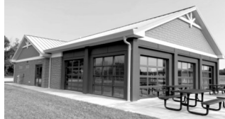
Pleasant View Park Pavilion

Once you receive a number, you must remain in the City Hall lobby until the Clerk's Office opens for business at 8:30 a.m. Park permit applications will be accepted and processed in the order of numbers distributed. No telephone or mail-in applications are accepted. Non-Franklin groups may apply after April 1st.