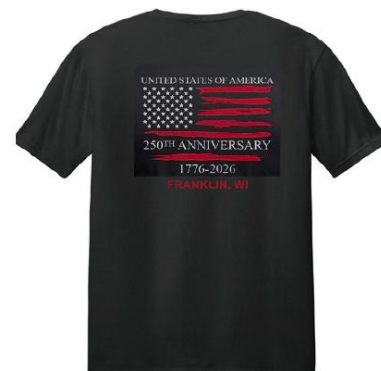
Front and back of T-shirts for sale or complimentary per donation levels above.