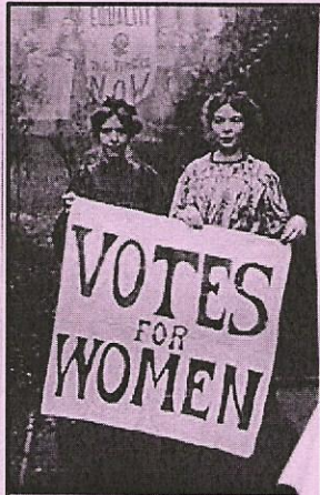
Advocating for the Vote