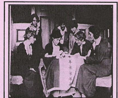
Sewing the Victory Flag