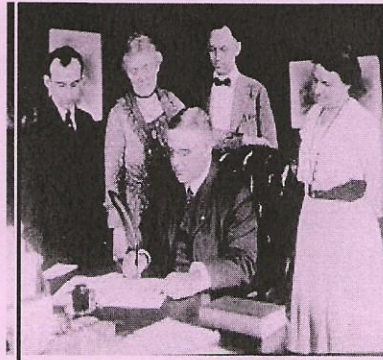
Signing 19th Into Law