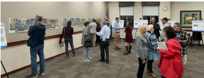
Photo: Community members provide feedback on the four alternative alignments at Public Meeting #1 on October 28, 2025.

There are two Public Involvement Meetings planned during the design of this project. The first PIM was held on October 28, 2025, from 5:30 PM to 7:00 PM, to obtain public input regarding the alternatives under consideration. The second PIM will be held on May 13, from 4:00 PM to 6:00PM, to present the preferred alternative.