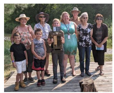
Eagle Nature Trail Pull-A-Thon Team members proudly displaying their 2021 trophy.

Our Garlic Mustard Pull-A-Thon is an annual fundraiser event, where we encourage folks throughout southeastern Wisconsin to protect the woodlands of their neighborhoods by pulling this invasive plant. Our 2021 goal was to collectively pull 20,000 pounds and raise essential funds for the fight against invasive species. We fell a little short of our goal, but we hope that is due to a reduction of garlic mustard populations in our region as a result of Pull-A-Thon efforts over the past 9 years!