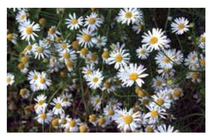
Scentless chamomile (Tripleurospermum inodorum)