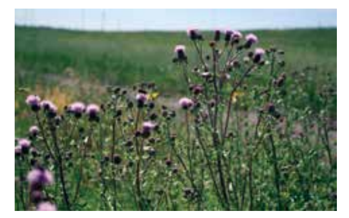
Canada thistle (Cirsium arvense)