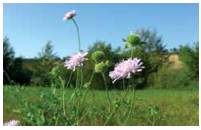
Field scabious (Knautia arvensis)