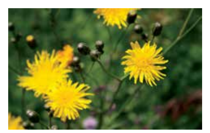
Perennial sow-thistle (Sonchus arvensis)