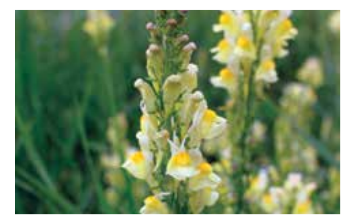
Yellow toadflax (Linaria vulgaris)