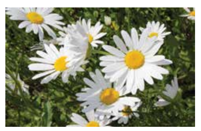
Ox-eye daisy (Leucanthemum vulgare)