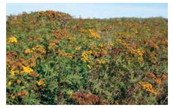
Common tansy (Tanacetum vulgare)