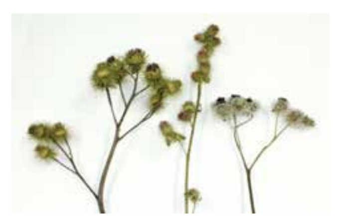
Burdock (Arctium species) great, common, woolly