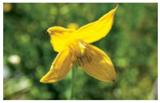
Yellow clematis (Clematis tangutica)