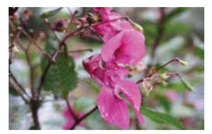
Himalayan balsam (Impatiens glandulifera)