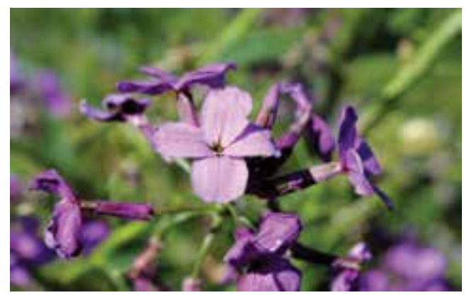
Dame's rocket (Hesperis matronalis)