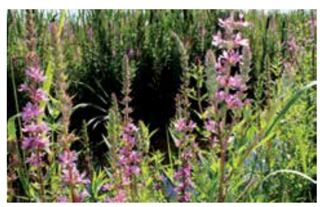
Purple loosestrife (Lythrum salicaria)