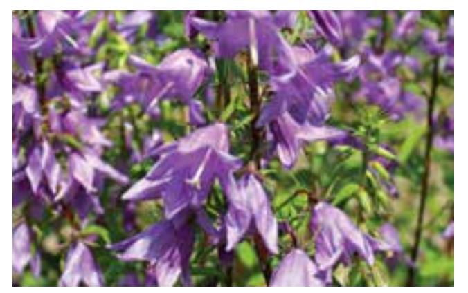
Creeping bellflower (Campanula rapunculoides)