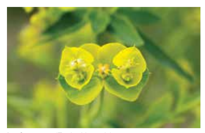
Leafy spurge (Euphorbia esula)